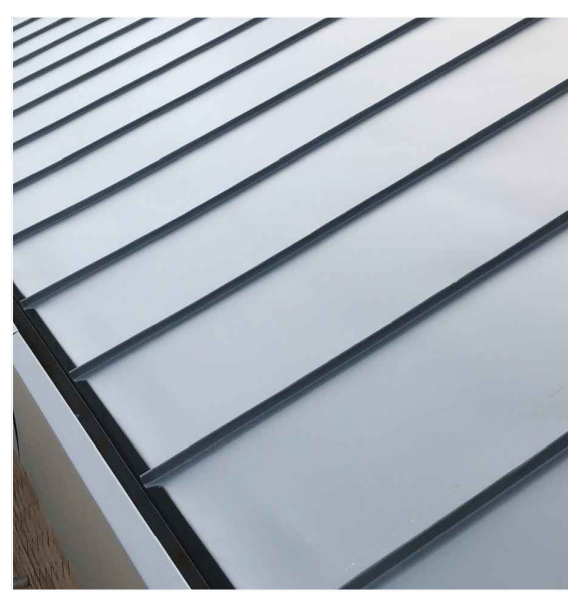
05 - Zinc (or equiv) standing seam roof cladding with integral concealed gutter in Dark Grey