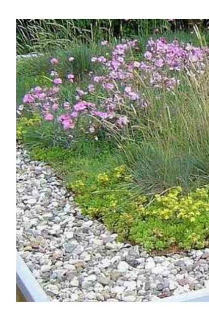
06 - Sedum roof with gravel perimeter drainage and internal drainage