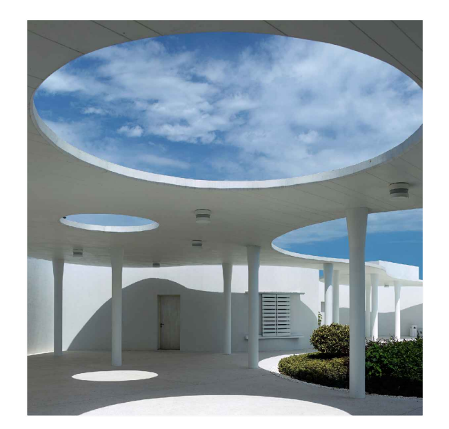
09 - White painted roof canopy & columns with integral gutter