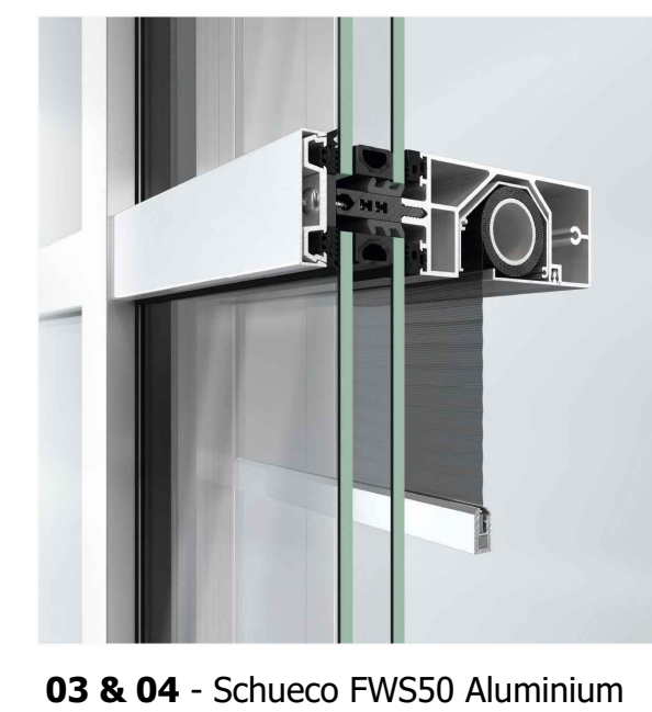
glazing facade system or eqiv. (03) with integral blind system (04)

(Colour TBC) with matching grout colour - High impact resistance - frost proof marine grade