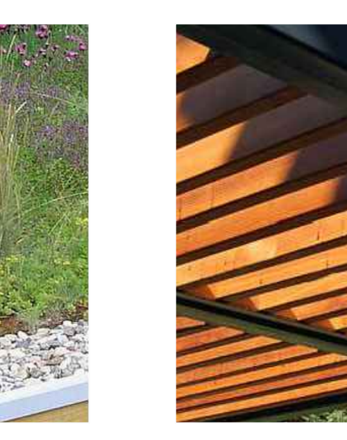
07 - vertical timber slat canopy set into dark grey metal frame to match glazing system