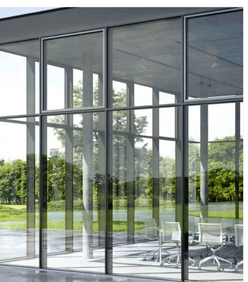
03 - Schueco FWS50 Aluminium glazing facade system or eqiv. in dark grey with solar control double or triple glazing. Frame system target u-value of 0.9W/m<sup>2</sup>K or better