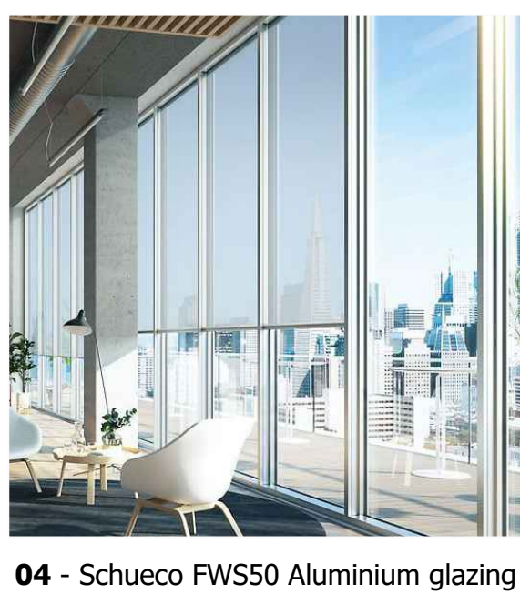
04 - Schueco FWS50 Aluminium glazing facade system integral blind system for solar gain & glare control. Colour TBC and transparency levels subject to detail calculations